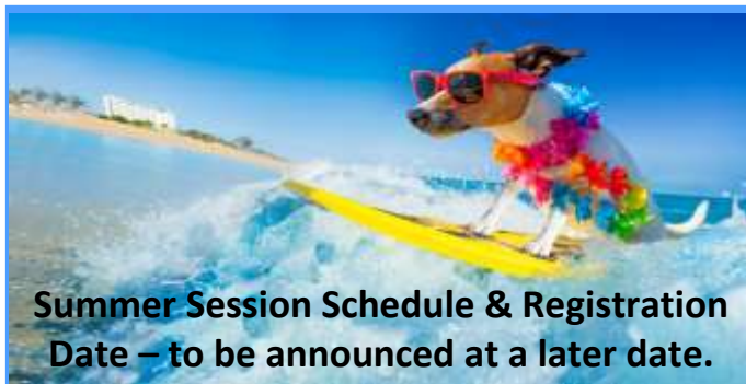
Summer Session Schedule & Registration Date – to be announced at a later date.

Sat, April 30 - June 18 (6-classes off 5/28 & 6/18)